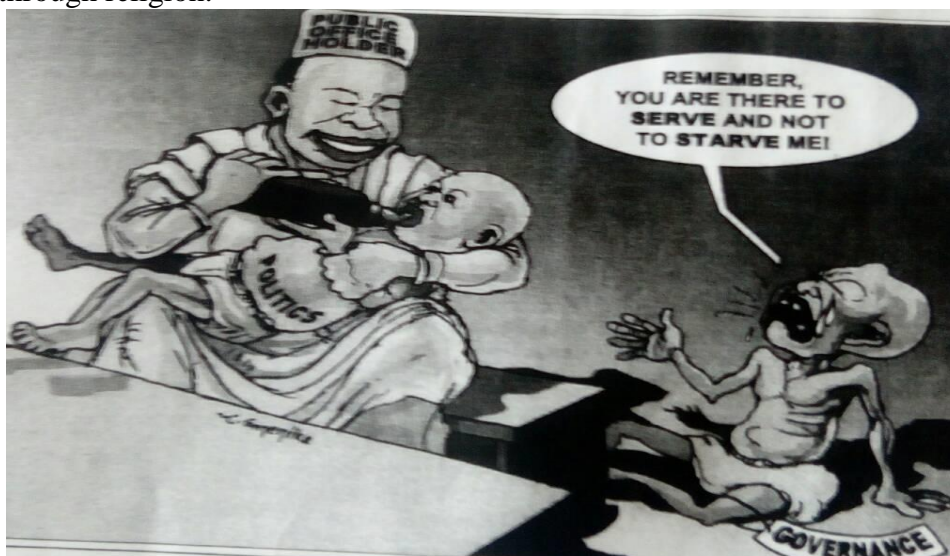
Fig. 2. 'To serve and not to starve' cartoon

This New Telegraph newspaper cartoon vividly depicts the unfortunate but reality of socio-political and economic situation in Nigeria. It shows that the Nigerian government is making concerted effort in fighting corruption through the EFCC but this "national disease" has eaten up all the essential nerves of the national heart. The reality is that the more the government is fighting the fire of this social evil called corruption, the stronger and wilder it becomes as people have devised different and sophisticated ways of siphoning national treasury without being caught. In fact, the mantras "say no to corruption" and "Change begins with me" of the present administration of President Muhammadu Buhari are ironically becoming clarion calls for more corrupt practices. Hence, the cartoon makes an emergency national call for selfless leadership, collective social responsibility and a total fight against corruption by both the ruled and rulers in Nigeria without being partisan or pitching tents of hatred through religion.