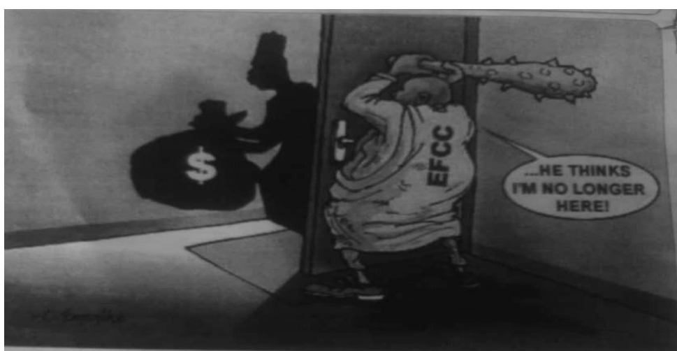
Fig 1. 'No longer here' cartoon

EFCC is an anti-graft agency created by the former Nigerian President Chief Olusegun Obasanjo. The agency is saddled with the responsibility of detecting financial crimes and also arresting people found culpable in this type of crime. The agency comprises policemen that are specially trained to detect and arrest financial fraudsters and looters.