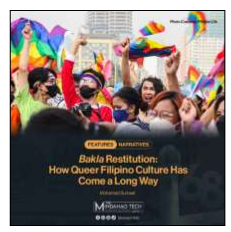
Figure 2. P2

The colors of the rainbow flag and LGBTQIA+ flag are a recurring element across all the photos, acting as a unifying symbol of the community's pride, diversity, and resilience. In Figure 1, the flag is draped around the human figure, which may symbolize empowerment and a unique identity. The vibrant rainbow trail flowing outward from the closet illustrates the overflowing talent and transformative journey from suppression to liberation, emphasizing the beauty, uniqueness, and vitality of embracing one's true self.