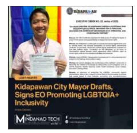
Figure 3. P3

The photo in Figure 2 shows the iconic rainbow flag appearing in various forms, like handheld banners and capes, which turned the public spaces into vibrant celebrations of inclusivity. The flag visually unites diverse participants, symbolizing solidarity and collective advocacy for LGBTQIA+ rights. Similarly, Figure 3 shows a photo of the mayor holding an